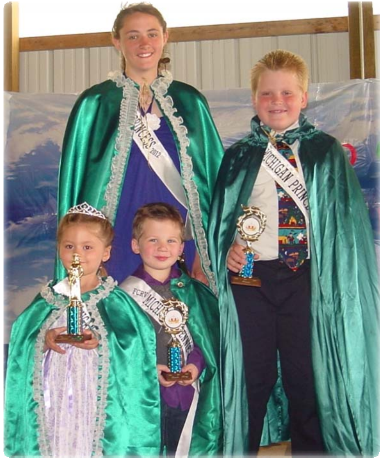
2012 - 2013 Youth Royalty